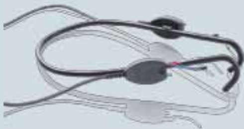
Twin Headset (both sides with probe and reference microphones)

Realistic expectations are the major psychological factor in use of the hearing aid. Visible Speech is a practical tool to that end. Explain compression, power output limitation and other advanced features in a simple way - also for the relatives who are often a motivating factor when people seek hearing assistance. Normal hearing view allows for comparing the hearing loss to normal hearing.