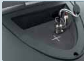
Easy access built-in test chamber

Dedicated input and output connections reduce the need for swapping cables at any point in your evaluations. A hinged cabling cover maintains a professional appearance in your office.