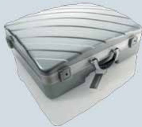
Hardcover carrying case.

An optional hard cover case adds portability to Affinity 2.0 's many functions. Ideal for the dispensers who make home visits or distribute their time among a number of clinics or institutions. The specially designed case carries Affinity 2.0 and all accessories.