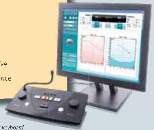
Dedicated audiometer keyboard