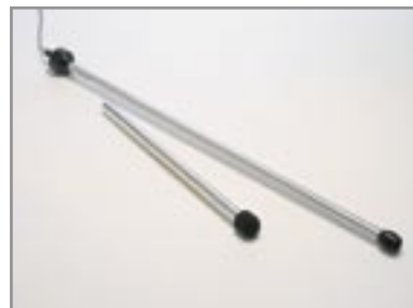
A standard probe for adult testing and a calibration tube are included with the RhinoScan software.

The standard nose adapters are tailored to fit right and left nostrils, with a pleasant, non-slip surface that is anatomically designed to offer maximum patient comfort and a perfect fit. These units can also be used with the RhinoStream module. Applying sealing gel avoids sound leaks between the adapter and the nostril.