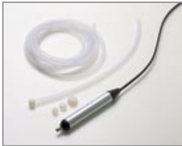
A mini probe for infant screening is available (optional).

The Windows® based interface is fast and intuitive. Saving information is simple, as is the process of recalling patient records from the database. During any subsequent patient consultation, the customizable on-screen display makes an ideal tool for comparing and discussing analyses in detail.