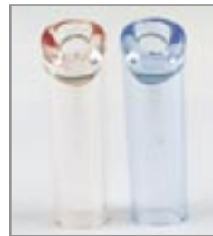
The nose adaptors, tailored to fit right and left nostrils.